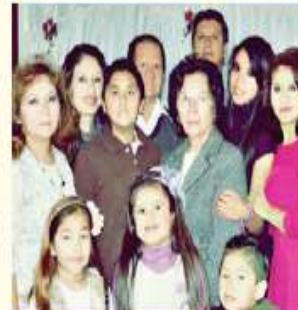
A Mexican immigrant family today, at their home in Phoenix, Arizona, USA.