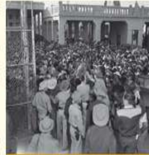
Mexico, 1964. Mexican workers await legal employment in the United States.

In the USA today, there are about 35 million Spanish-speaking Mexican Americans and Mexican citizens, some in established families, some recent illegal immigrants. They now include students in American high schools and universities, graduates and working professionals. The situation of Mexicans in the USA can still be difficult, but it is improving.