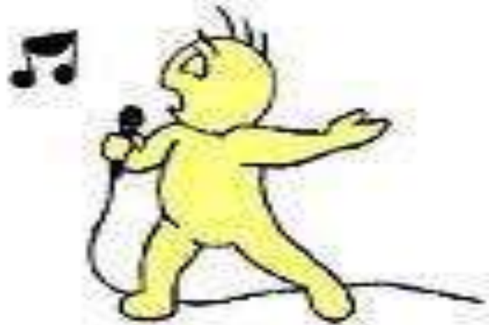
sing irregular verb