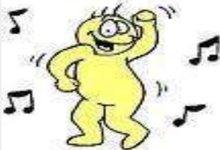
dance regular verb