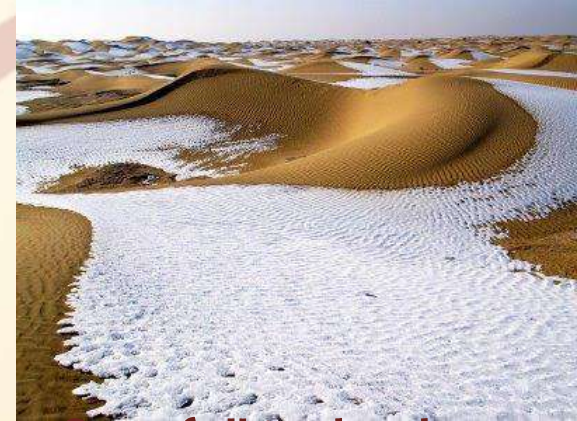
Snowfall in the desert