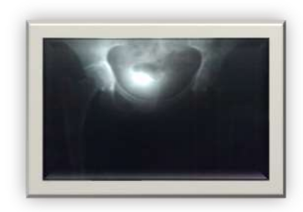
X-Ray 1. Anteroposterior pelvic X-Ray, with a bad technique, very penetrated, no iliac crest is observed, tool in pelvic hole, in the right hip; no intertrochanteric are is evaluated, it is observed a loss of coxofemoral space, with subchondral sclerosis. Left hip is not visualized.