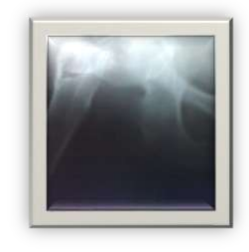
X-Ray 3. Right anteroposterior hip X-Ray, bad technique, it not observed a complete femoral component, it seems like the acetabular cup in a very vertical position, it should be measured to better evaluate the prosthesis placement. It is needed a pelvis where the left hip appears too.