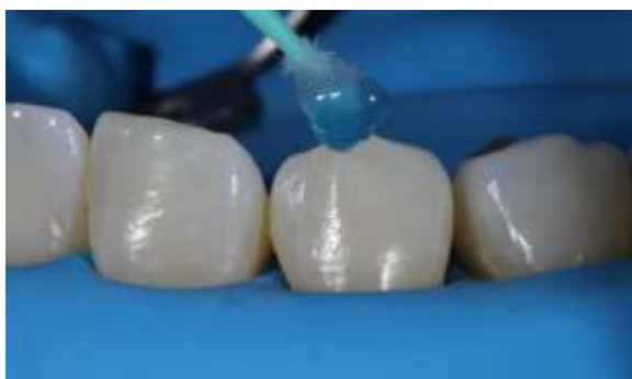
Figure 2. Application Papain gel in Tooth Enamel

In 2015, Valencia et al. carried out a study in pediatric patients to examine the effect of deproteinization on primary and permanent enamel. The findings revealed that the etching of the enamel of a primary tooth is poorer than that of a permanent tooth, which in turn negatively affects the adhesion of various restorative materials. 18 However, it was highlighted that the implementation of a deproteinization procedure before acid etching shows significant potential to improve the quality of adhesion in dental restorations, applicable to both dental enamels. This observation underscores the importance of deproteinization as a valuable strategy to optimize results in dental restorations of both primary and permanent teeth. 22