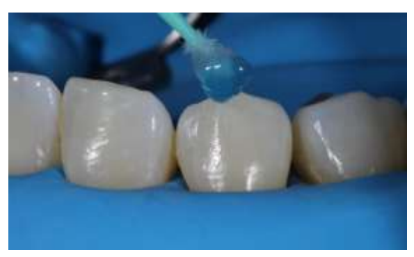
Figure 2. Application Papain gel in Tooth Enamel

In 2015, Valencia et al. carried out a study in pediatric patients to examine the effect of deproteinization on primary and permanent enamel. The findings revealed that the etching of the enamel of a primary tooth is poorer than that of a permanent tooth, which in turn negatively affects the adhesion of various restorative materials.<sup>18</sup> However, it was highlighted that the implementation of a deproteinization procedure before acid etching shows significant potential to improve the quality of adhesion in dental restorations, applicable to both dental enamels. This observation underscores the importance of deproteinization as a valuable strategy to optimize results in dental restorations of both primary and permanent teeth.<sup>22</sup>