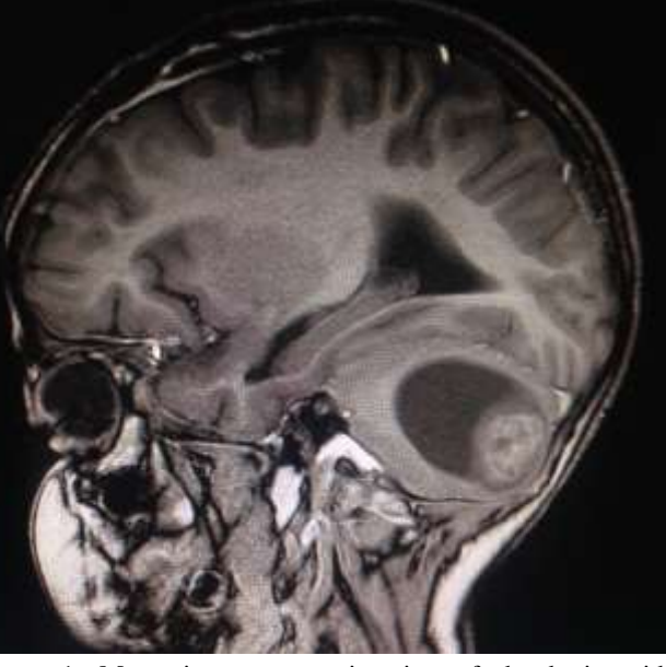
Figure 1. Magnetic resonance imaging of the brain with cerebellar pilocytic astrocytoma.

The diagnostic approach requires clinical suspicion necessarily combined with neuroimaging evaluation.<sup>2,3</sup> These studies are also essential because they provide information for preoperative planning, as well as the probable etiology, although finally the definitive diagnosis is given by the histopathological study.<sup>1,10,47,49</sup> At computed tomography (CT), most cerebellar and cerebral pilocytic astrocytomas have a well-demarcated appearance with a smaller round or oval shape.<sup>10</sup> At magnetic resonance (MR), pilocytic astrocytoma is typically isointense to hypointense relative to normal (Figure 1), brain with T1weighted pulse sequences and hyperintense compared with normal brain with T2-weighted pulse sequences.<sup>10</sup> Reports of MR spectroscopy performed on the soft-tissue portions of pilocytic astrocytomas have documented elevation in the choline (Cho) to N-acetylaspartate (NAA) ratio, ranging from 1.80 to 3.40 (compared with 0.53–0.75 for normal cerebellum).<sup>10</sup>