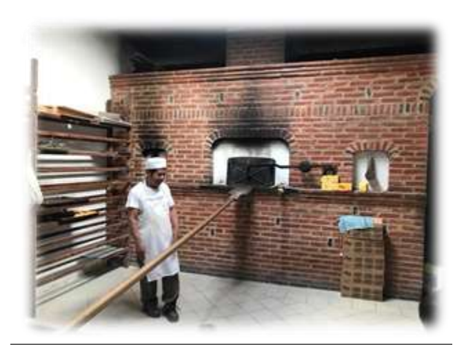
Photo 8 Traditional Oven of Pastes: Near the center of Pachuca, Hidalgo. There are the pastes LA PROVIDENCIA or better known as "Don Armando" pastes, a place where 15,000 pastes were once baked for Miguel de la Madrid.