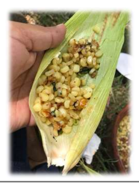
Photo 12 Esquites borrachitos (corn with alcohol): During the season of fresh corn, in the community of Tepatepec the farmers make various preparations based on this corn, highlighting a dish for its elaboration with pulque "los borrachitos". Cooked com with epazote, serrano pepper and pulque.