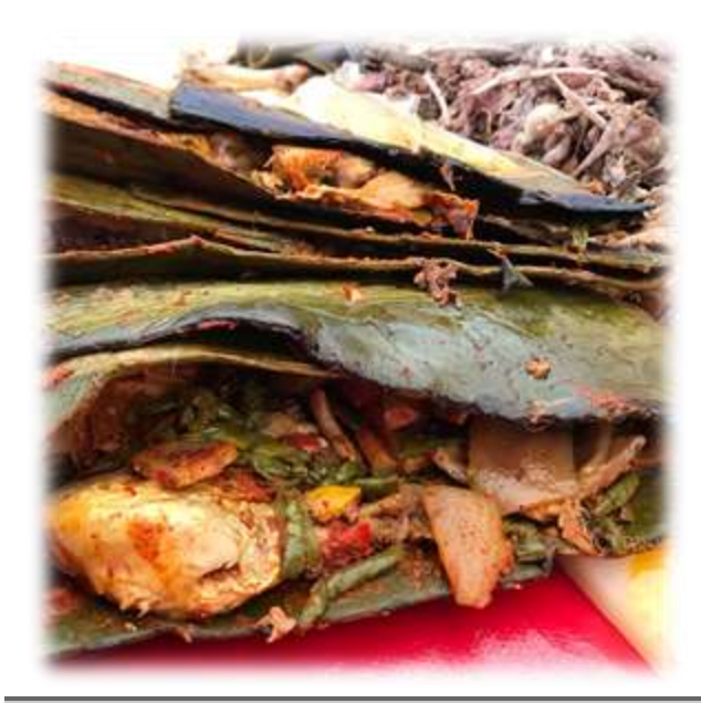
Photo 7 Ximbo: Typical dish of Actopan, Hidalgo. It is characterized by wrapping the meat in maguey's leaves and being steamed in an underground oven. The most popular ximbos are made with chicken, pork, Chamorro and sometimes skunk.