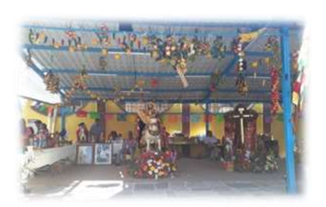
Photo 4 Santo Patrono Santiago Apóstol: Fruit Fair, held in Tecozautla, Hidalgo. Where the devotees decorate the church's atrium with different fruits, such as pomegranate and figs, banana, apples, and others; as a sign of gratitude for their harvests, those fruits are given to visitors after the end of the festivities. Photograph by José Armando Carrillo Silvano, 2018.