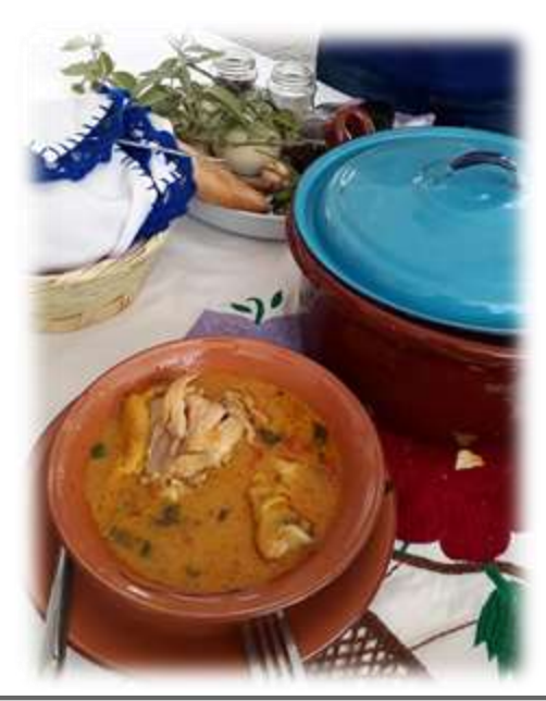
Photo 13 Pollo en Azafra: Nearby Tecozautla Hidalgo. There are the communities of Pañhé, Bomanxotha and la Mesilla where this dish is made as an offering to the deceased during the raising of the cross. La Azafra is a type of wild pepper found in the nearby hills.