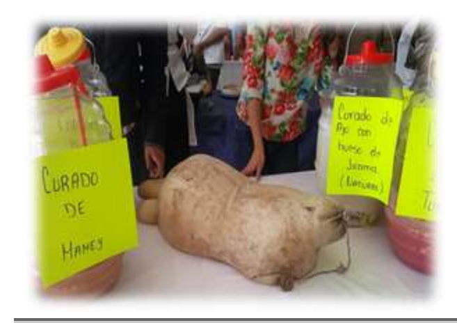
Photo 1. Odre or Colambre: made of animal skin such as sheep, which served as a container originally used for the transportation of pulque. In some communities that produce pulque in the state of Hidalgo is still used. Photograph by José Armando Carrillo Silvano, 2018.

The dishes and beverages described in the table are part of the traditions and ancestral food of the Otomís, Nahuas and Tepehuas communities of the region, having specific days for certain dishes that allow people to do their daily activities such as agriculture, the breeding and marketing of the products that represent the economic life of the cooks. Some dishes are still not cooked in the region, because the majority of the ingredients that are used to cook them are not produced anymore.