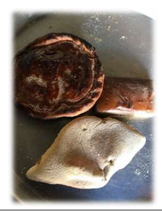
Photo 11 Traditional bakery in Zempoala: Photograph by Ixachi Cravioto Balderas, 2018.