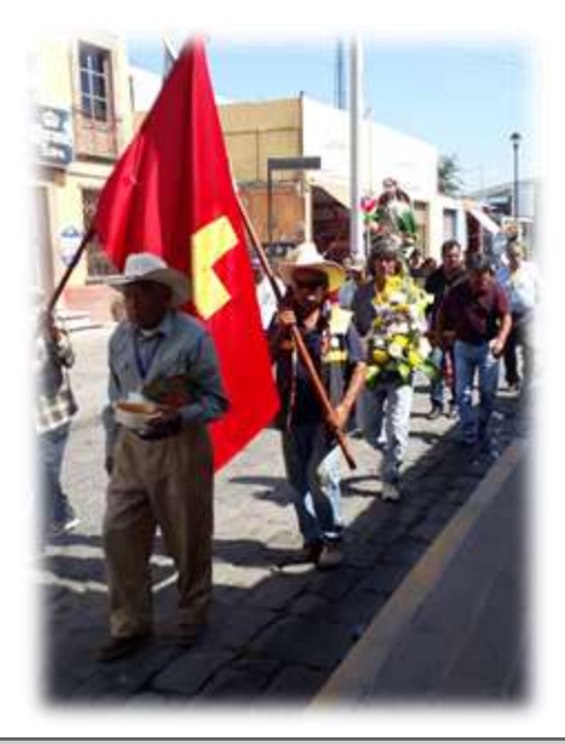
Photo 5 Procession of Santiago Apóstol: Following the belief that the Saint appeared on the hill of Sanabria, the devotees make this walk every year to the place, carrying the image of the saint.