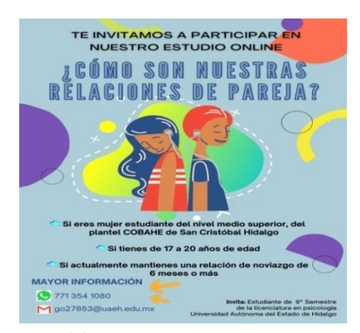
Figure 1. Invitation to participate in the study is shown through a Flyer with contact information.

The process began with the publication of a flyer on different social networks, inviting young women to participate in the study (see figure 1). The Rosemberg Self-esteem Scale and the Dating Abuse Questionnaire were adapted to Google Forms, where the participants responded online in approximately 20 minutes. It is worth mentioning that the Google form gave a presentation of the person who directed the study and its objective. The importance of protecting the identification data of each participant during the application was highlighted, for which informed consent was sent to them, stating that their answers would be totally confidential and for academic purposes.