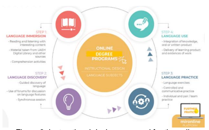
Figure 3: Instructional design proposed for the online English subjects

Each week of study the student goes through the four steps of the cycle, from being exposed to authentic input to developing an oral or written product that integrates the language knowledge and skills they have acquired.