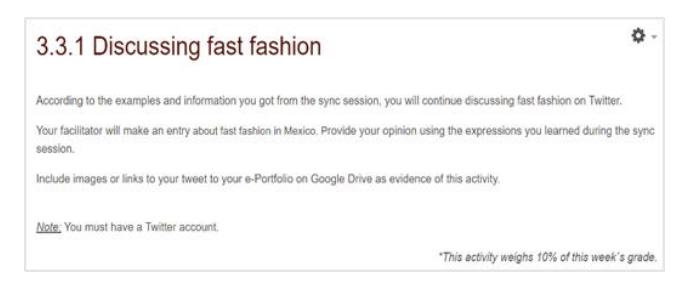
Figure 6: Example of a communicative task for language practice at the B1 level

As for the practice stage, controlled and communicative activities were included within the cycle. Littlewood (1981) suggests that structural practice provides a point of departure for other, more communicatively oriented activities, therefore, students are asked to answer language practice exercises on web pages that contribute to the mastery of grammar and vocabulary to then, work with their peers to complete more demanding language tasks. In contrast with the activities before the redesign, the new tasks for practice involve interaction among students as they discuss a topic through the platform forums, or work collaboratively in information-gap, information-gathering, and opinion-sharing activities.