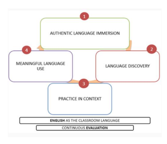
Figure 2: Language Teaching Cycle

With this approach, a lesson begins with natural written and oral texts to provide students with relevant language input. Students develop comprehension tasks related to speaking and/or writing that allow the development of communicative skills.