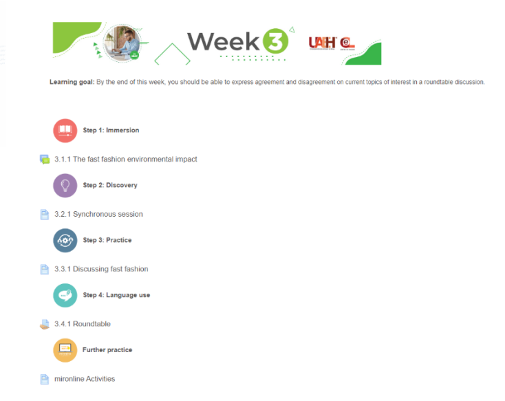
Figure 9: Visual look of a week of work on the Garza Platform

Because of that reason, icons representing each step of the cycle were included on the platform so that students could identify a new stage of work as well as banners to let students know when a week of work would start.