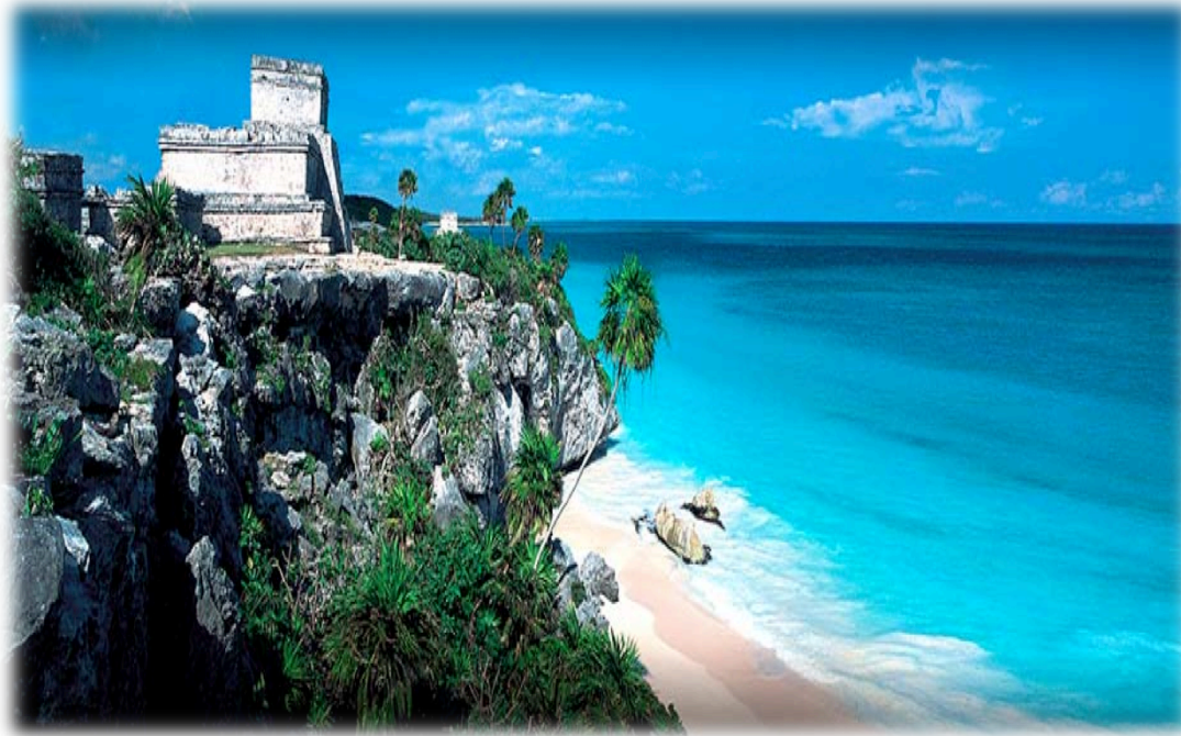
Figure - 6

Can talk about possible situations in the future using affirmative forms