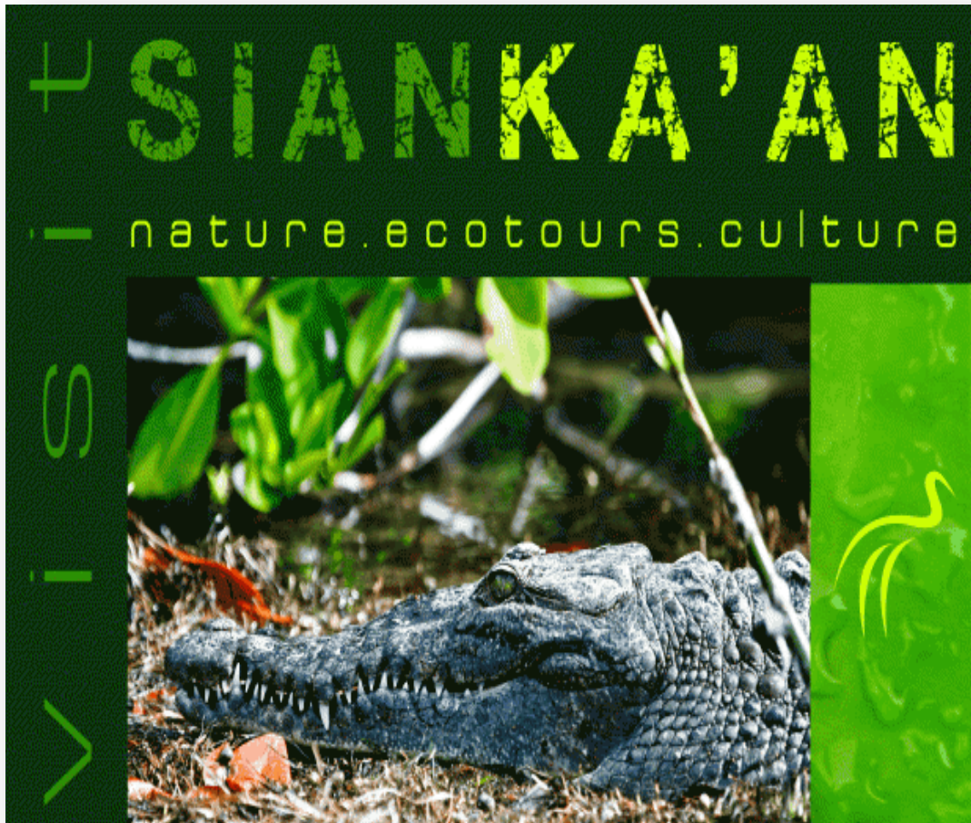
Figure - 5

Can talk about possible situations in the future using affirmative forms