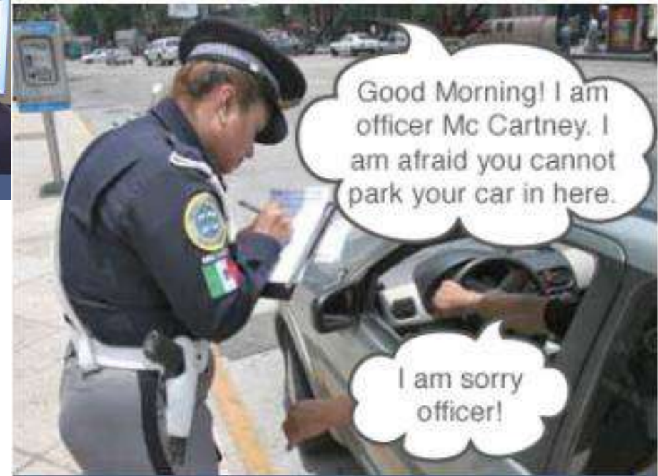
Adapted from Contreras, L. (2012). Police [photo]. Taken from https://goo.gl/WfWf9x