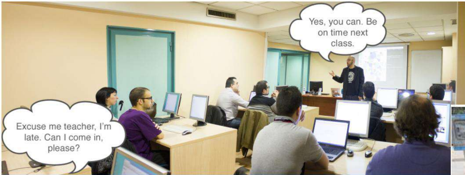
Adapted from Escolaespai (2014). Teacher [photo]. Taken from https://goo.gl/LvwuH3